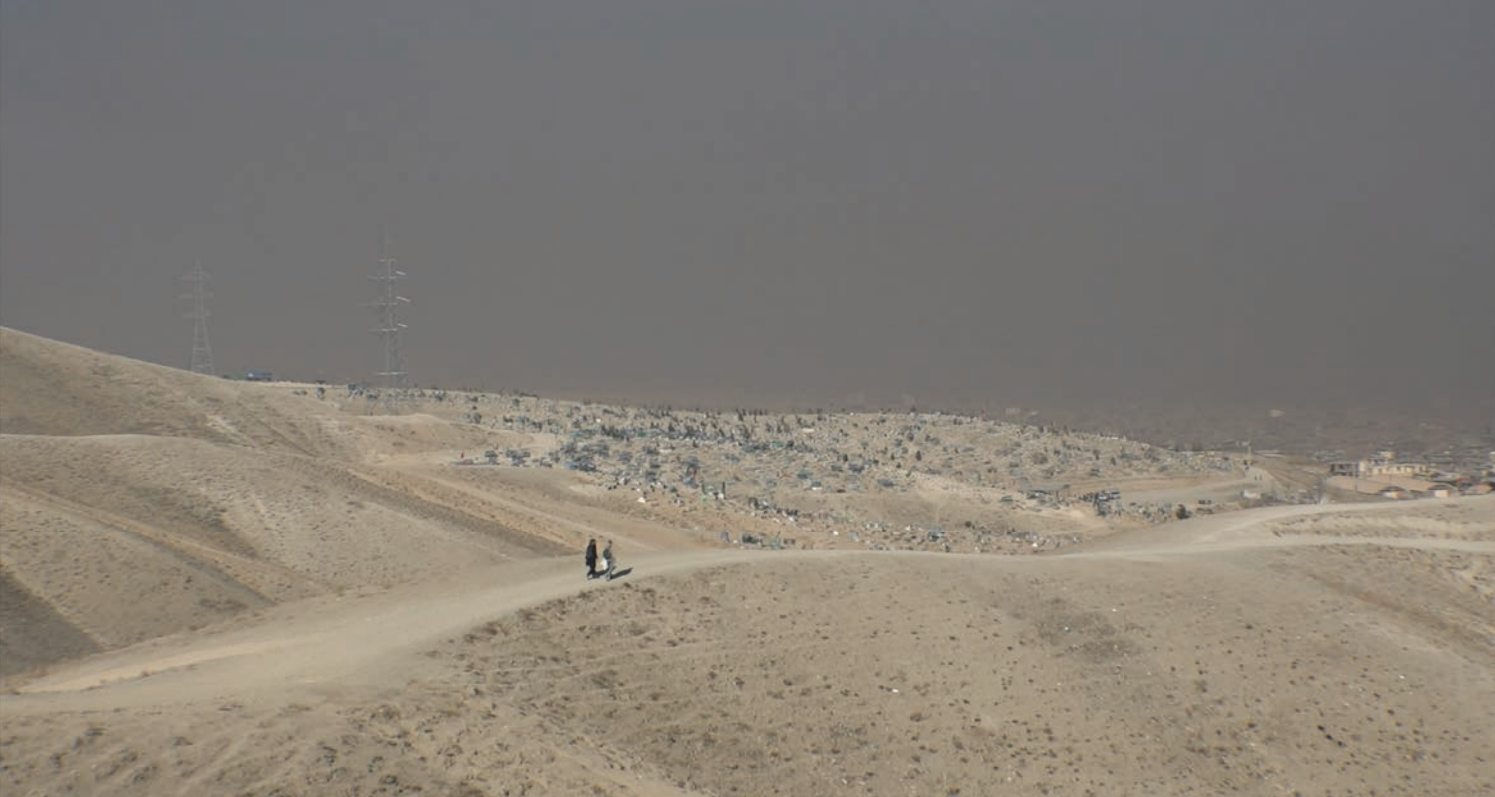
Haji Nabi Hills, Southwest Kabul, Afghanistan.

southern Afghan heartlands. This type of charisma was based not on eloquence or fiery soundbites, but rather by cultivating the perception of an otherworldly, selfless, guileless persona that seemed to many Talibs the antidote to the corrupted materialism around them. The contrast to the worldly Osama bin Laden could not be greater. In this sense, the story of Mullah Omar shows us just how different the Taliban and al-Qaeda really are. Today, as the prospect of peace hinges, in part, on trusting whether the Taliban can indeed split with al-Qaeda, understanding Mullah Omar's story is more crucial than ever.